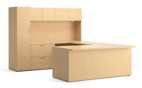
U WORKSTATION Shown with return and modular top