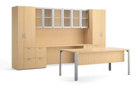
TABLE DESK WORKSTATION Shown with credenza, stack-on storage, and storage towers.