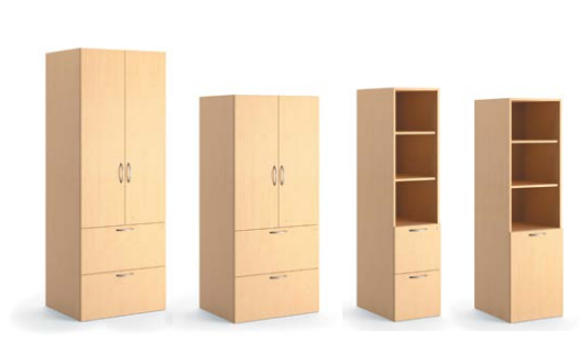
6H/5H X 30"/18" WIDE 5H X 15" WIDE