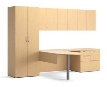
PENINSULA WORKSTATION Shown with bridge and modular top