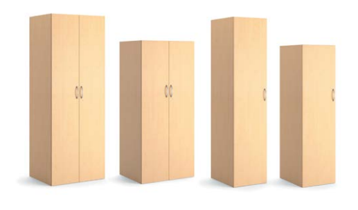
6H/5H X 30"/18" WIDE 5H X 15" WIDE